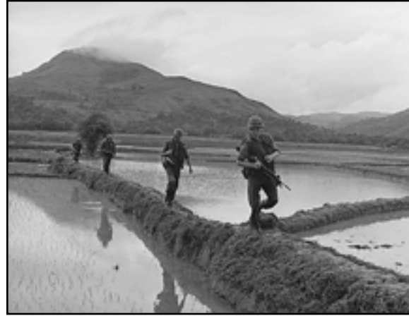
Operation Harvest Moon

Navy ship, locate and destroy a radio transmission facility, return to the