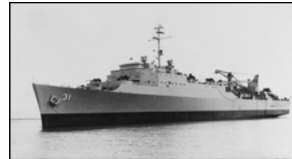
USS Point Defiance LSD-31

USS Valley Forge LPH8 with Fox and Golf companies aboard. After completing the last Dagger Thrust operation, 2/1 was unexpectedly committed to Operation Harvest Moon on December 10. It was a grueling and miserable operation that took place in the Que Son Valley between Da Nang and Chu Lai . 2/1's job was to enter and search the Phouc Ha Valley .