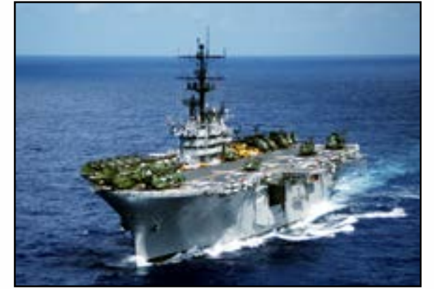
USS Iwo Jima LPH-2

in a five-day jungle survival course on the Bataan Peninsula . We marched into a mature bamboo forest and learned the basics of staying alive with limited resources. Echo and Hotel left the Philippines in early November aboard the USS Montrose APA-212 along with the USS Monticello LSD35 and rejoined the SLF helicopter carrier