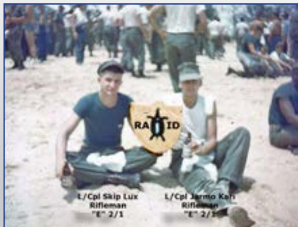
The Raider plaque: a Sea Turtle with a knife on its shell and the letters RAID.

Training began in early June working with rubber boats at Lake O'Neill . It included an individual night swim across the lake wearing Mae West life jackets. Then the company moved to Del Mar and spent two weeks training with rubber boats in the ocean. The training consisted of getting a fully loaded boat off the beach through the crashing surf and navigating in the ocean. During this period everyone really began to embrace the "Raider" moniker. All of the rubber boat work led up to an ambitious training exercise conducted off the coast of Camp Pendleton . The mission was to land the company at night from a