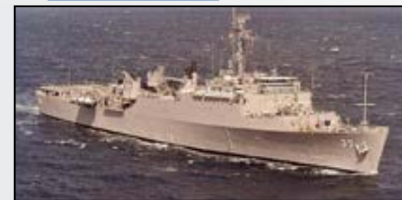
USS Monticello LSD-35

It was my last memory to any reference to Echo company Raiders. After Harvest Moon, the battalion left the SLF and took over responsibility for the Phu Bai combat base . Sometime