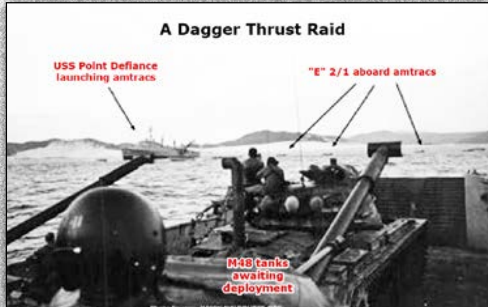
The USS Port Defiance deploys the Echo Raiders via amtrac on the Dagger Thrust raid

Echo company would be the lead company for the amphibious component of four Dagger Thrust raids, transferring to the USS Point Defiance and hitting the beach in amtracs.