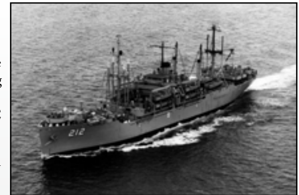
USS Montrose APA-212

Replacements and new additions did not share our history. From then on it was just plain grunt